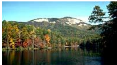
Table Rock Mountain provides a towering backdrop for an upcountry retreat at the edge of the Blue Ridge Escarpment. This 3,083-acre state park encompasses challenging hiking trails, two park lakes, a campground, rustic mountain cabins, meeting facilities and many other quality outdoor activities. The view at Table Rock is as breathtaking today as it was to the Cherokee Indians who once inhabited this area. Built in the 1930s by the Civilian Conservation Corps, the park still features many of the quality architecture and stonework of the CCC.

The park is listed on the National Register of Historic Places and is also a South Carolina Heritage Trust Site. Table Rock is a " DiscoverCarolina Site ", which provides curriculum-based science education programs for South Carolina school children.